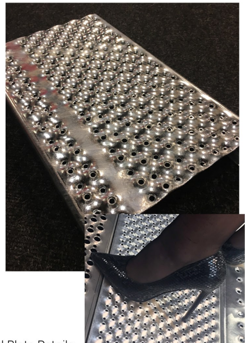
End Plate Details