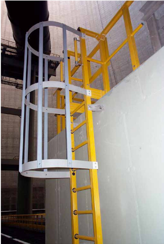
Right and below: GRP vertical ladders in industrial use.

GRP vertical ladders are suitable for both indoor and outdoor use. Our GRP ladders are produced in accordance with EN ISO 14122-4:2004 Safety of machinery – permanent means of access to machinery – part 4: fixed ladders.